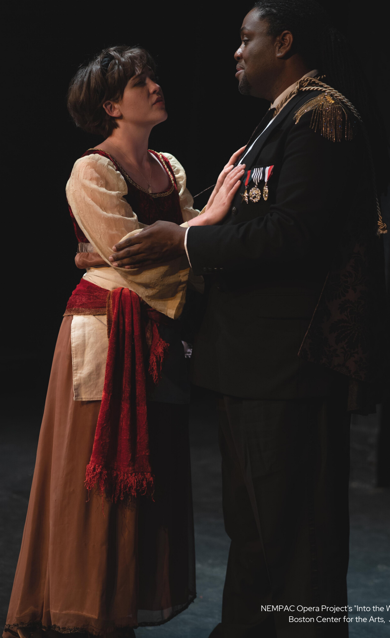
NEMPAC Opera Project's "Into the Woods" at the Boston Center for the Arts, June 16, 2022