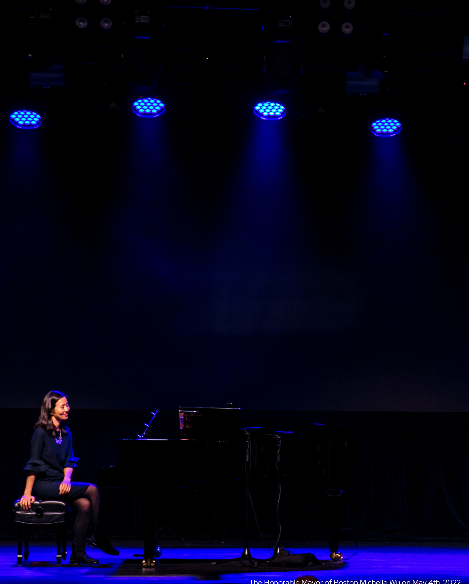
The Honorable Mayor of Boston Michelle Wu on May 4th, 2022 NEMPAC 20th Anniversary Celebration at Big Night Live