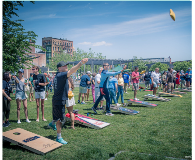
North End Cornhole Classic raises $62,650 for the Marshall Scholarship Fund