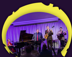
VINTAGE VOCAL QUARTET JULY 11